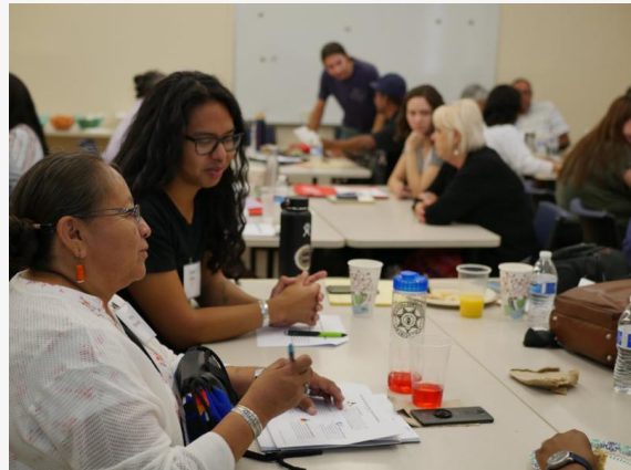
First day AILDI Summer 2019

...A highlight of the AILDI summer program was a symposium that celebrated AILDI's 40 years of Language Education